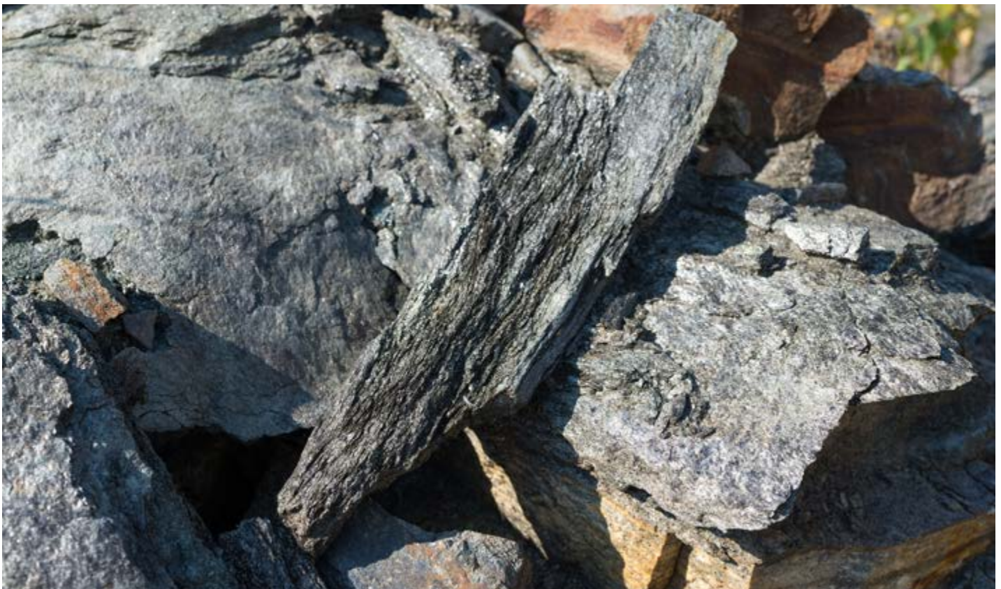
Leliyn is Australia's largest graphite deposit located 200km south of Darwin.