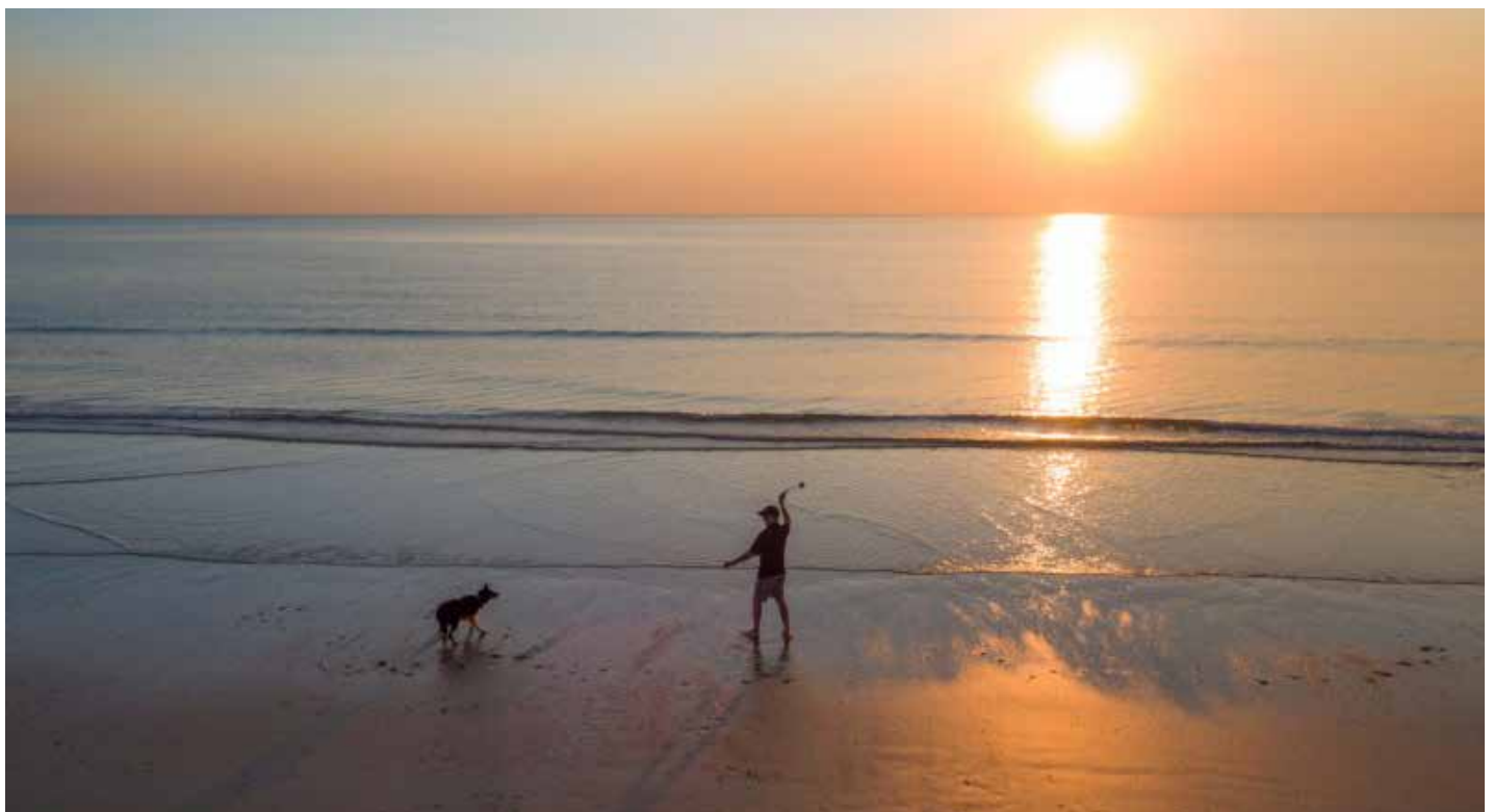
Gunn Point beach.