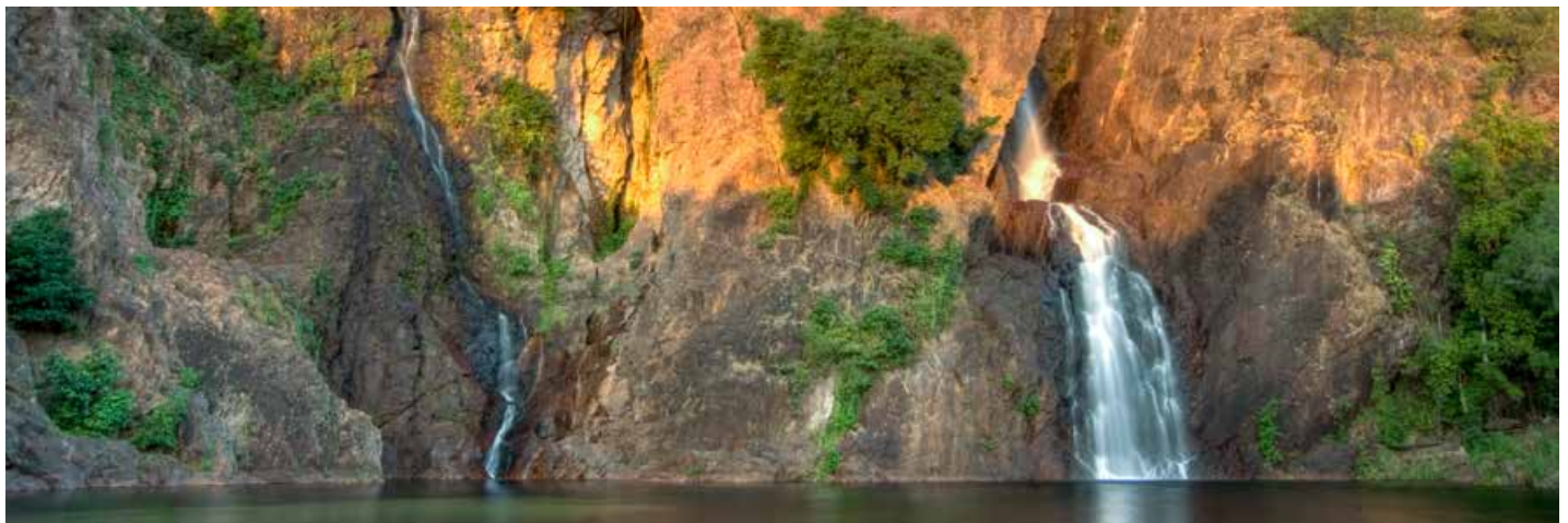
Wangi Falls, Litchfield National Park