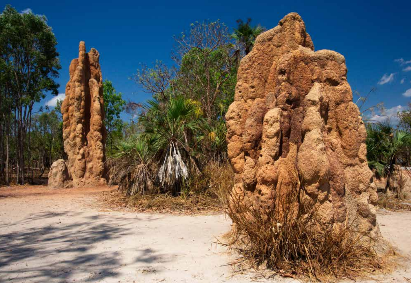
Termite Mounds, Litchfield National Park