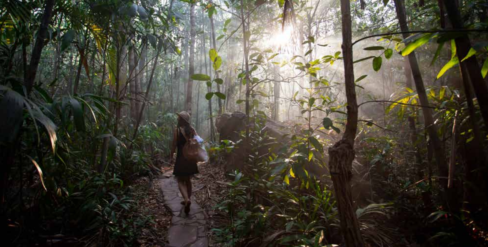
Shady Creek Walk, Litchfield National Park