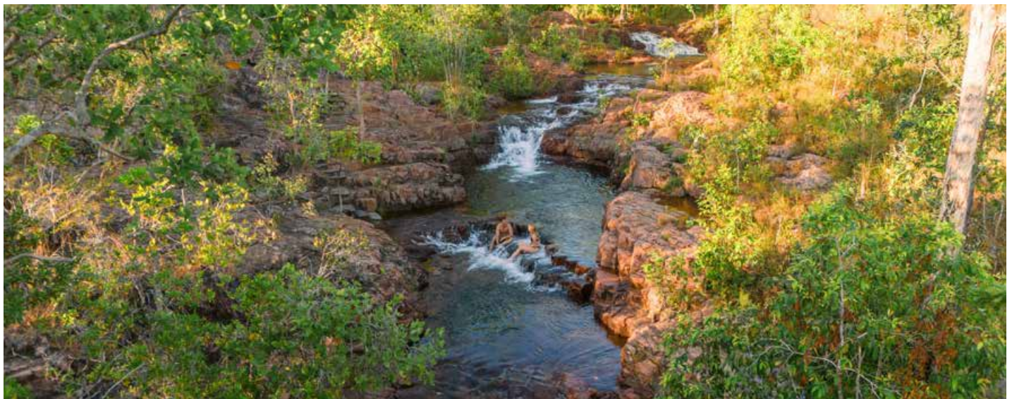
Buley Rockholes, Litchfield National Park